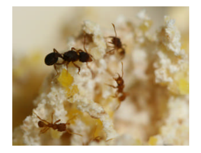
Figure 2. Mycocepurus smithii ants on their garden. The mother queen (the bigger individual) and her daughter workers (smaller individuals) are genetically identical.

cade, only females have been found in this species. Careful searches not only failed to find males in M. smithii nests, but also failed to find sperm in the spermathecae of reproductive M. smithii females. DNA fingerprinting analysis revealed that all workers in a colony are genotypically identical to each other and to their mother, thus ruling out sexual reproduction, which would generate genetic differences between offspring. In some insects, endosymbiont bacteria (e.g., Wolba chia , see Box 2) are known to switch the sex of their hosts [6]; M. smithii does not carry such